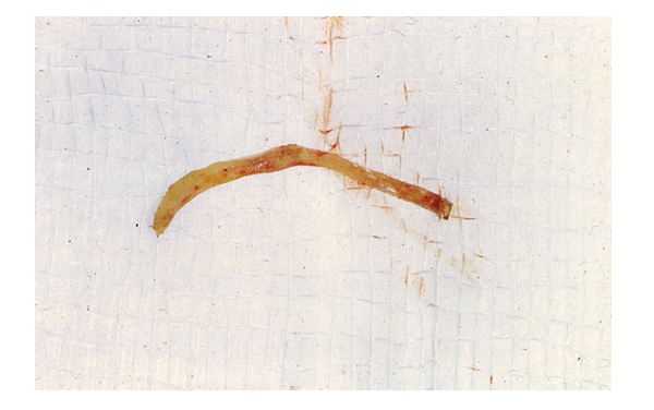
Fig. I-2b: (With permission from the American Dental Association)