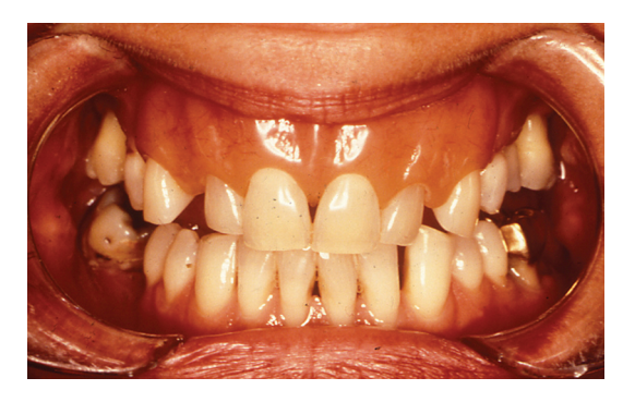
Fig. P-2b: Post-party gums

I, gingival margin and junctional epithelium are on enamel; stage II, gingival margin is on enamel and the junctional epithelium is partially on enamel and cementum; stage III, gingival margin is at the cementoenamel junction and the junctional epithelium is totally on cementum; and stage IV, gingival margin and junctional epithelium are totally on cementum (Gargiulo et al. 1961). See also active eruption, altered passive eruption, delayed passive eruption.