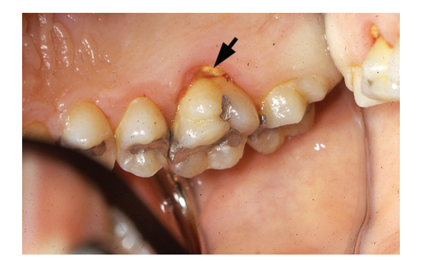
Fig. 1-2a: Arrow, elastic band in situ