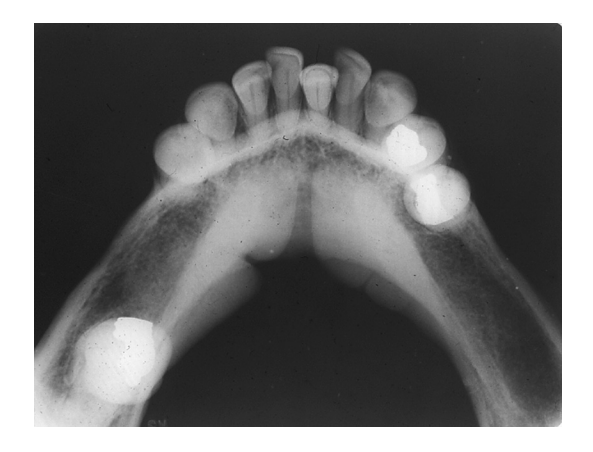
Fig. T-2b: Radiographic image of T-2a

methods of managing bony deformities, be they intrabony defects, craters, dehiscences, and/or fenestrations (See Figs. B-5 and P-7b) (Tibbetts 1969; Greenberg 1976). See also bone sounding.