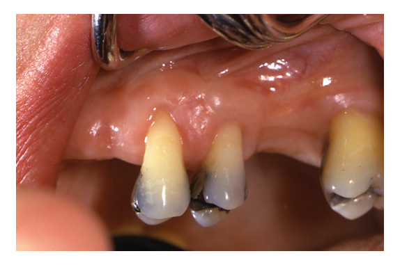
Fig. E-1d: Healing after 3 months

over the tissue, spraying sparks to produce a hard crust or scab, as from a burn (i.e., an eschar) (Flocken 1980; Azzi 1981). See also electrosurgery.