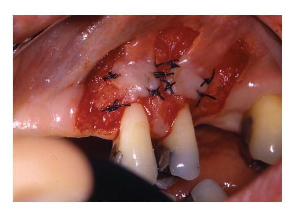
Fig. E-1c: Pedicle grafts repositioned