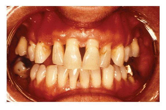
Fig. P-2a: Preparty gums