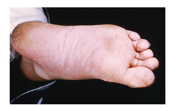
Fig. P-1c: Plantar hyperkeratosis