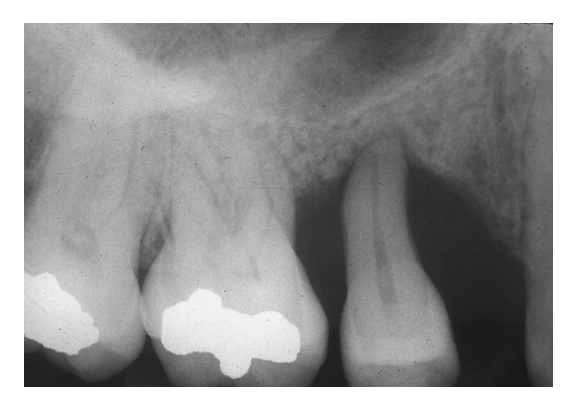
Fig. I-1a: (With permission from the American Dental Association)

Iatrogenic—This term describes an abnormal mental or physical condition induced in a patient by the effects of treatment (AAP 2001a). Iatrogeny, produced by either an inadvertent or erroneous treatment, may be a result of either acts of commission or acts of omission by the therapist (Vandersall 1975). Several examples of dental iatrogenics producing periodontal defects are (1) retained black silk sutures (Manor and Kaffe 1982), (2) retained rubber dams (Abrams et al. 1978), (3) improper oral hygiene technique (Gillette and Van House 1980), and (4) retained orthodontic elastics (See Fig. I-1a,b,c; Fig. I-2a,b,c,d) (Vandersall 1971; Vandersall and Slade 1978). See also runner, wicking.