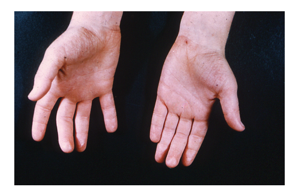
Fig. P-1d: Palmar hyperkeratosis (Illustrations P-1a,b,c,d courtesy of Dr. John R. Billen; with permission from Elsevier Publishing)

a Manifestation of Systemic Diseases" in the new classification system of periodontal diseases (Armitage 1999).